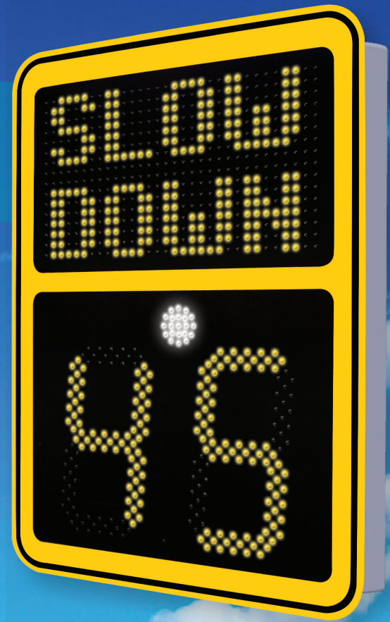
Choice of faceplate colors available

The new Traffic Logix® SafePace® 600 variable messaging sign is a versatile and full featured radar speed solution.